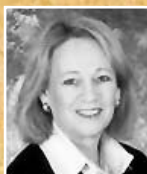
MARY SHAPIRO Chairman, SEC