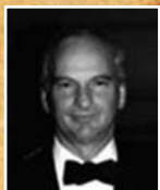
GEORGE ROBERTS Founder, Kohlberg, Kravis, Roberts & Co.