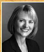
CAROL BARTZ CEO, Yahoo! Sponsored by NASDAQ