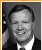
CHRISTOPHER COX Former Chairman, SEC