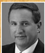
MARK HURD Chairman and CEO, Hewlett Packard Sponsored by McDermott Will & Emery