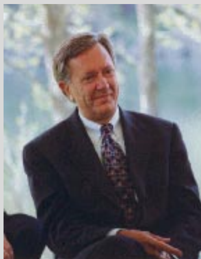
Bruce Babbitt, former U.S. Secretary of the Interior

Stanford Law School 559 Nathan Abbott Way Stanford, California 94305-8610 Fax: 650/725-8509