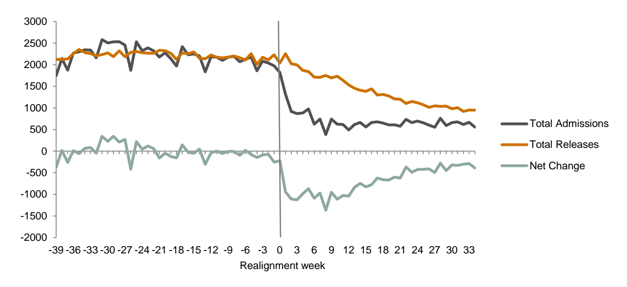
FIGURE 1 Weekly changes in state prison population, January 2011–May 2012